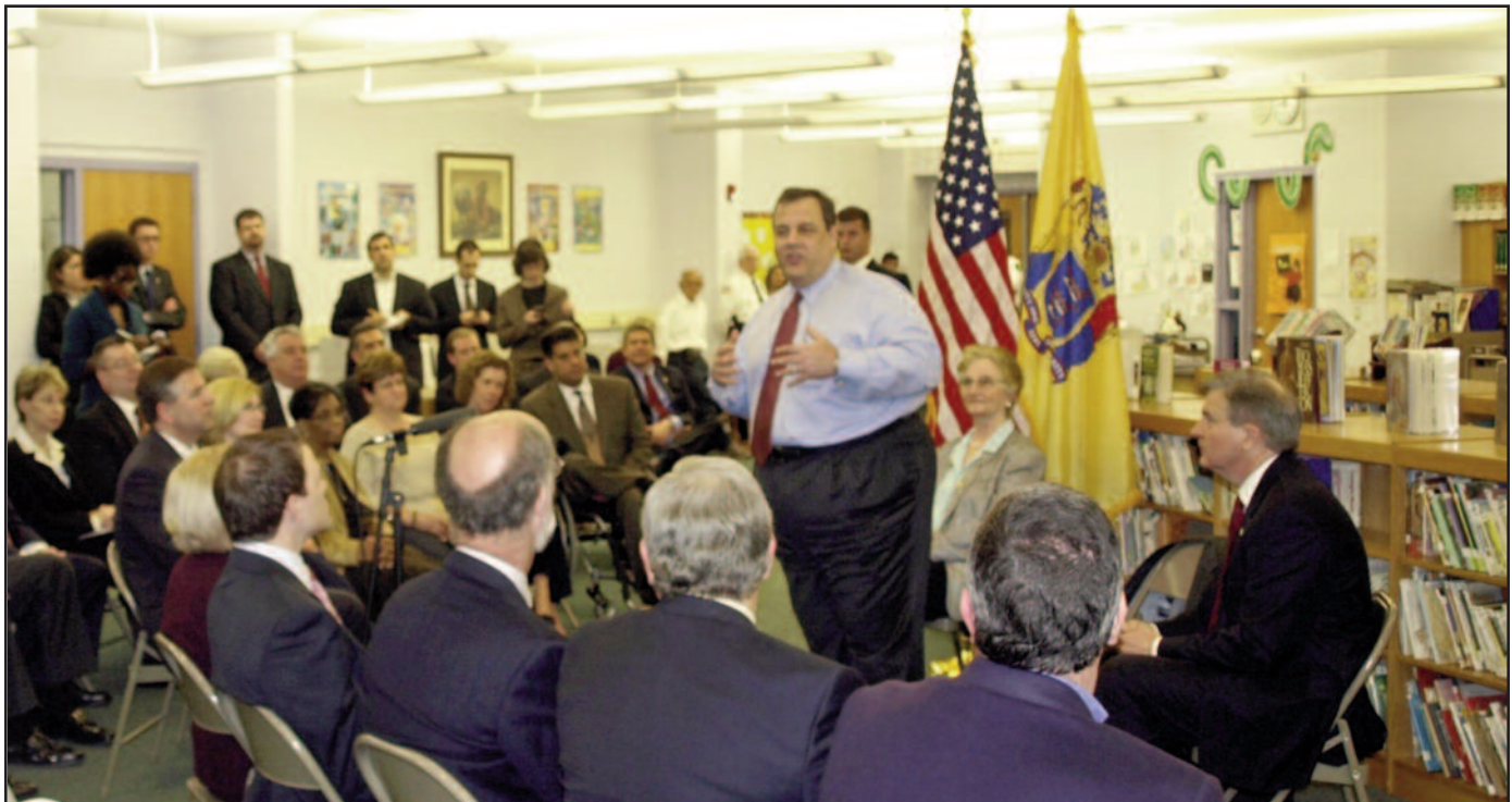
The Somerville Public School district welcomed Governor Christie on March 23, 2010.

WELCOME TO THE WEB www.somervillenjk12.org